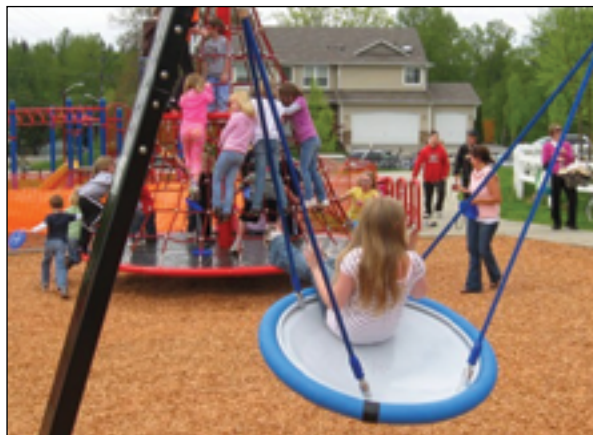
Rainier View Park playground.

• Monroe Skate Park: Located at Lake Tye Park, the skate park features six quarter pipes, three wedges, two fun boxes and a host of grinding rails.