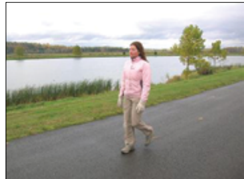
A hiker enjoys a peaceful morning stroll around Lake Tye.

network of wooded trails totaling 1.2 miles and the park itself is 90 acres.