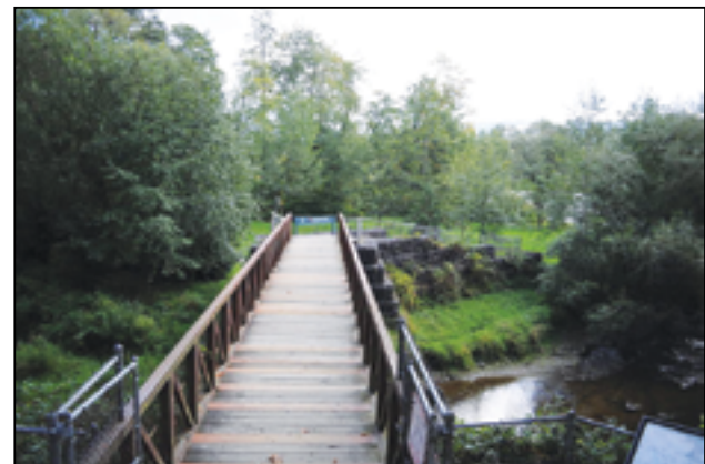
Al Borlin Park park is accessible by this footbridge from Lewis Street Park or by vehicle via Simons Road.