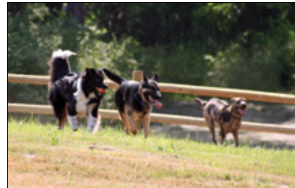
Wiggly Field off-leash dog park.

• Wiggly Field: 413 Sky River Parkway ~ This is an off-leash dog park with benches and parking lot.